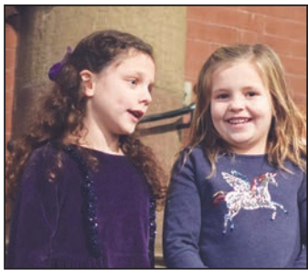
First-grade girls singing, "The Earth Song."

ADVERTISE IN THE BEACON HILL TIMES PLEASE CALL 781-485-0588