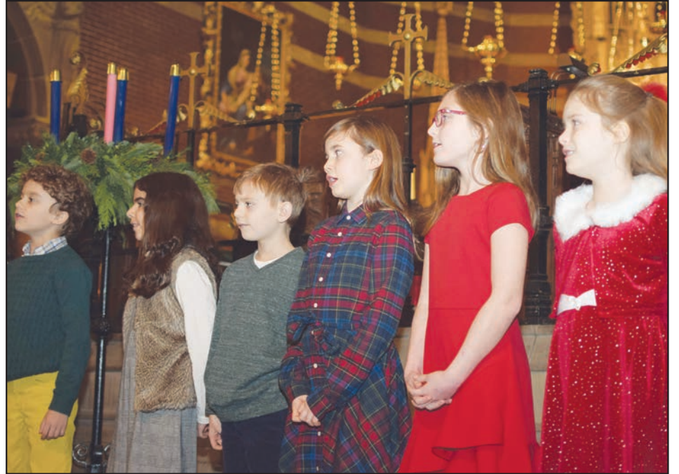
Third-grade singing, "September."