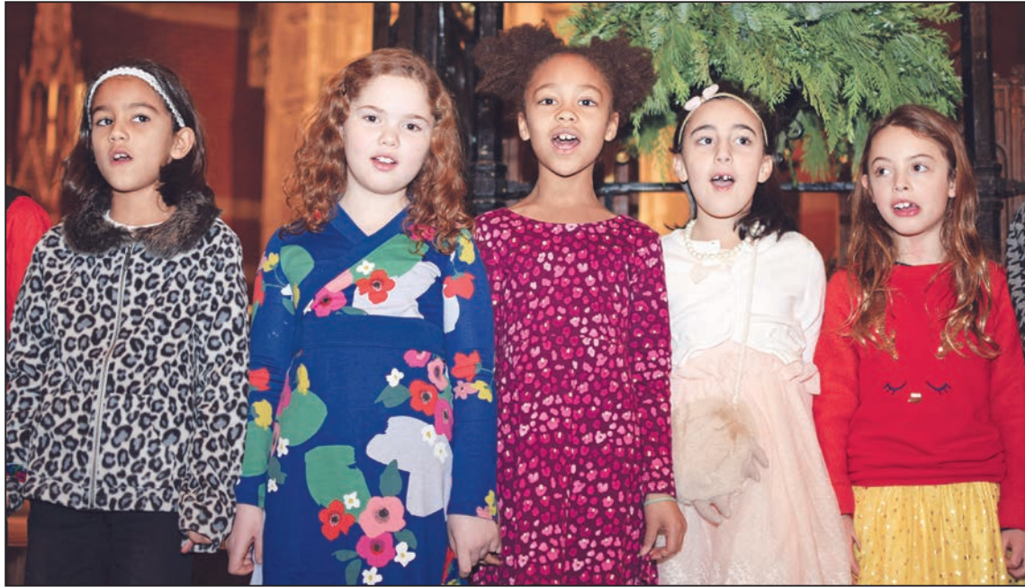
Second-grade singing, "The Leaves Turn Gold in the Fall."