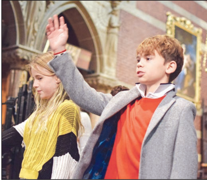
A sixth-grade boy reciting, "November."

Little ones proclaimed that success will follow when we care for the earth.