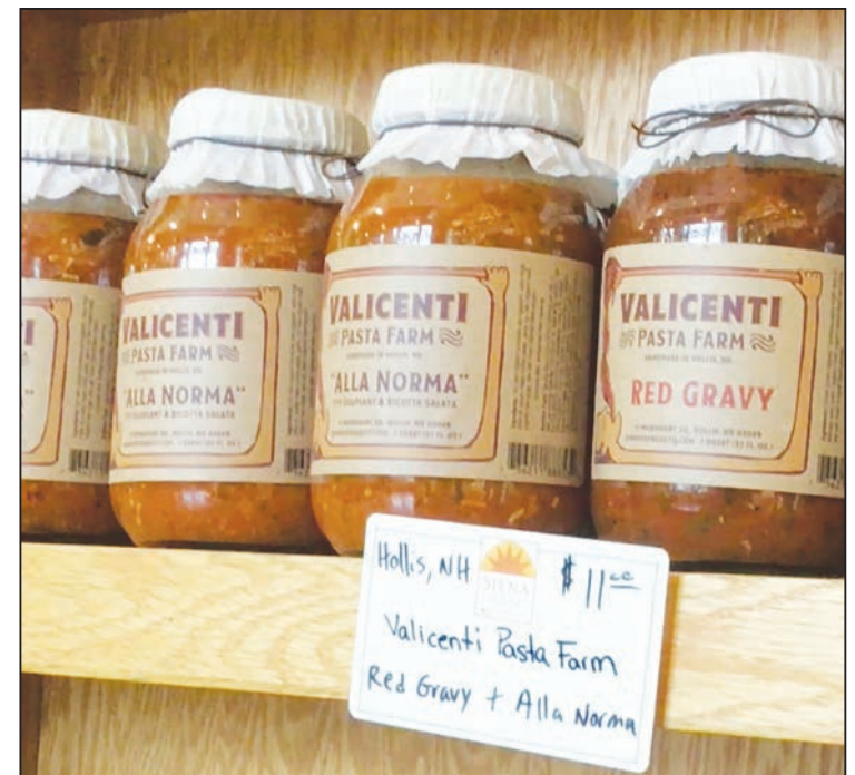
Valicenti Pasta Farm provides gluten free pasta and organic sauces for Torit Montessori.