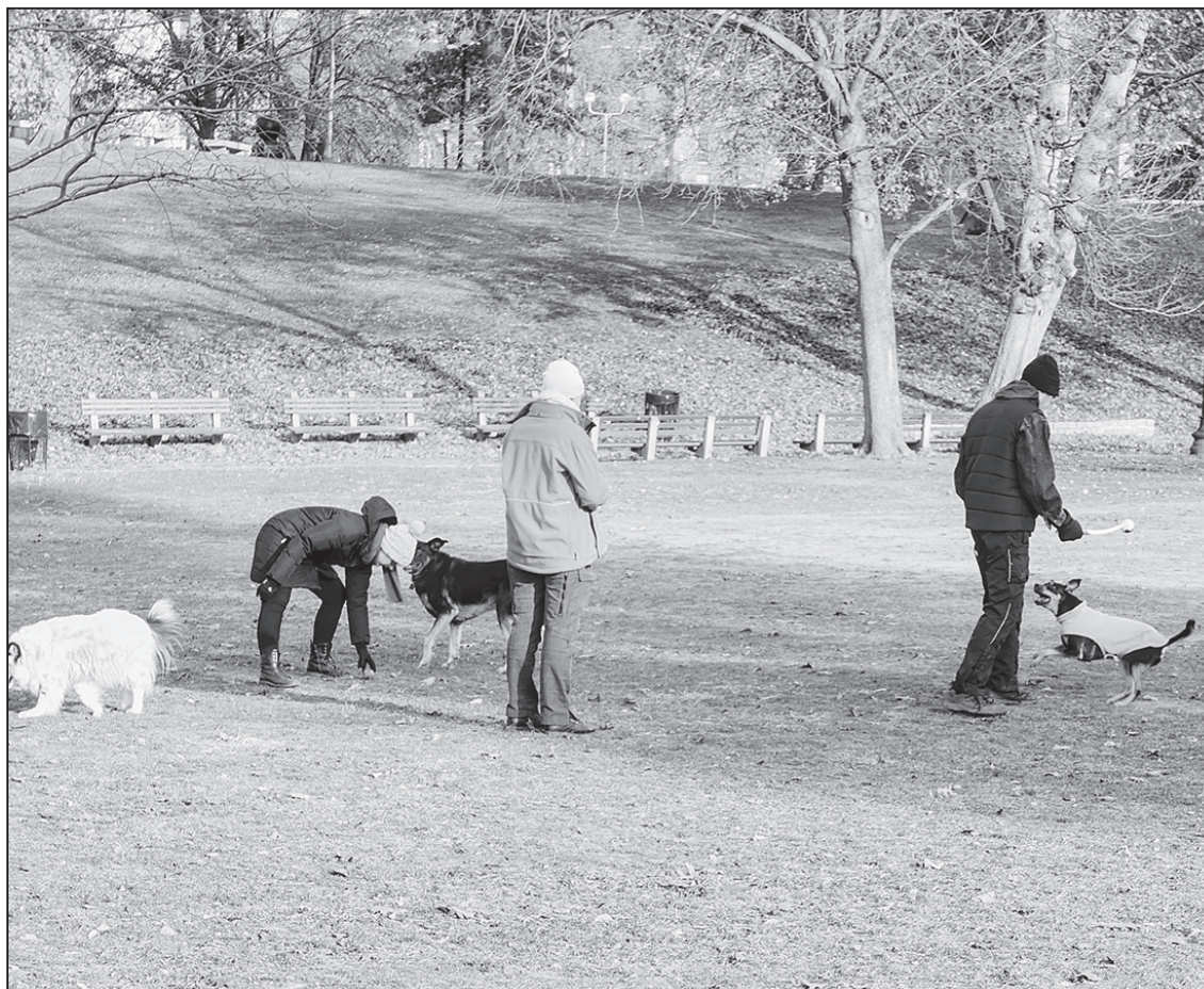
People with dogs bring activity and added security to our sidewalks and parks all year long, at all hours, and in all weather conditions.

We were among a group of dog families who attended an instructional meeting on how to spot and report any suspicion of Long