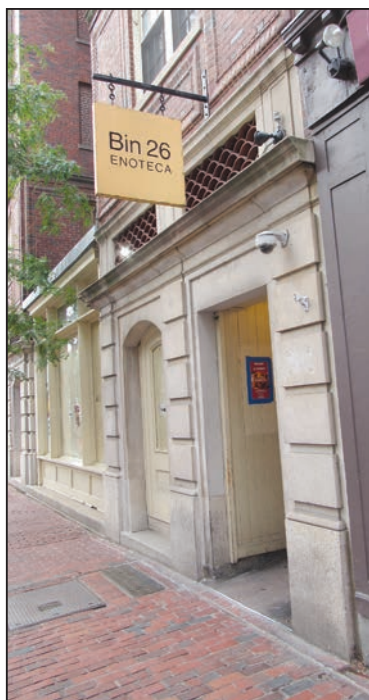
The future home of Zurito and former Bin 26 Enoteca restaurant space at 26 Charles St.