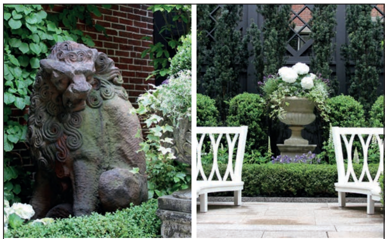
Benefit Cosmetics Boutique & BrowBar at 31 Charles St.