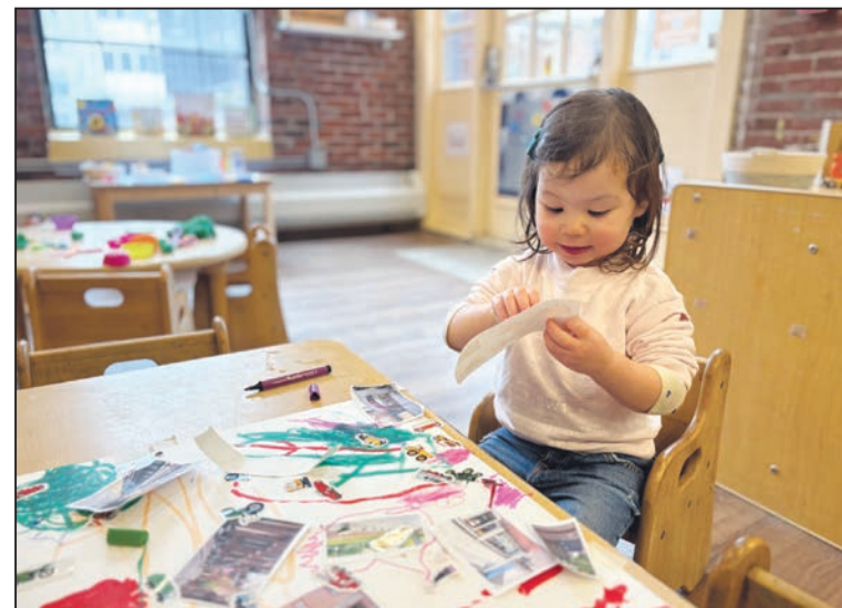
Fun with crayons at Beacon Hill Nursery School.

Hours: 8:00 a.m.-3:00 p.m. Grades 1-6; Kindergarten hours are M-TH 8:00 p.m.-3:00 p.m.; Fridays 8:00a.m.-noon with optional Kindergarten Enrichment, noon-3:00 p.m. After-school