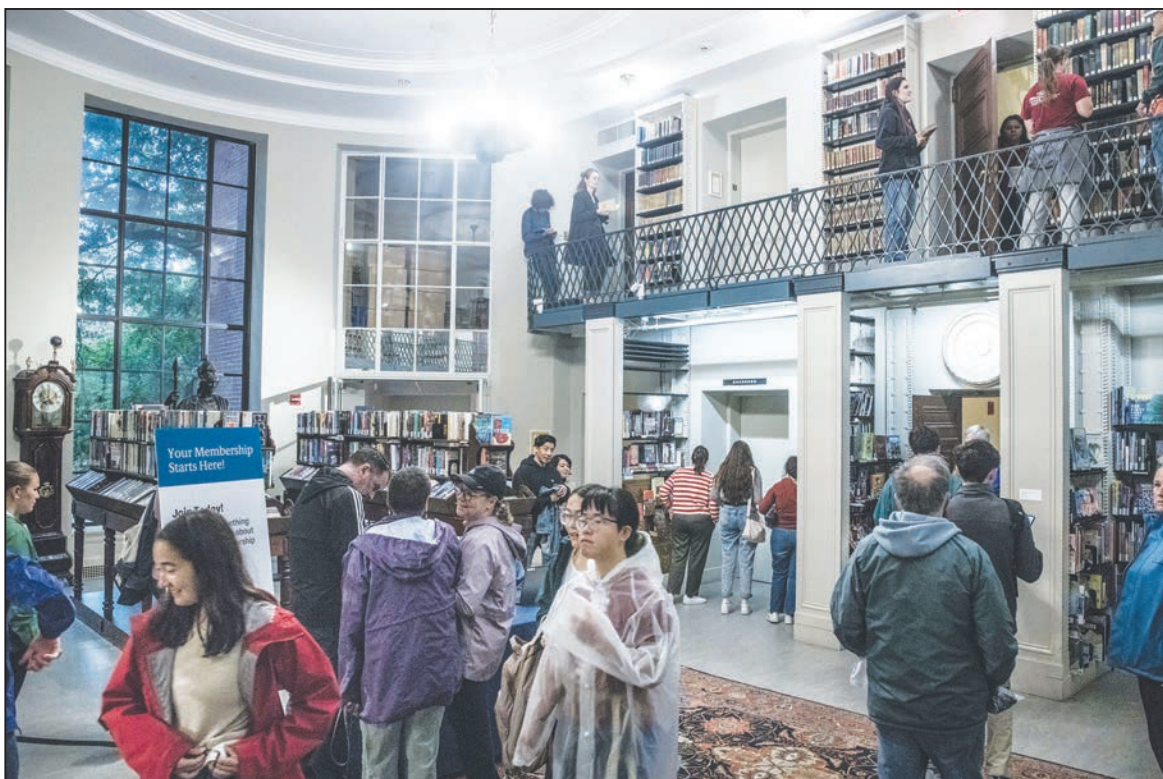
The Boston Athenaeum received many visitors to its open house event.