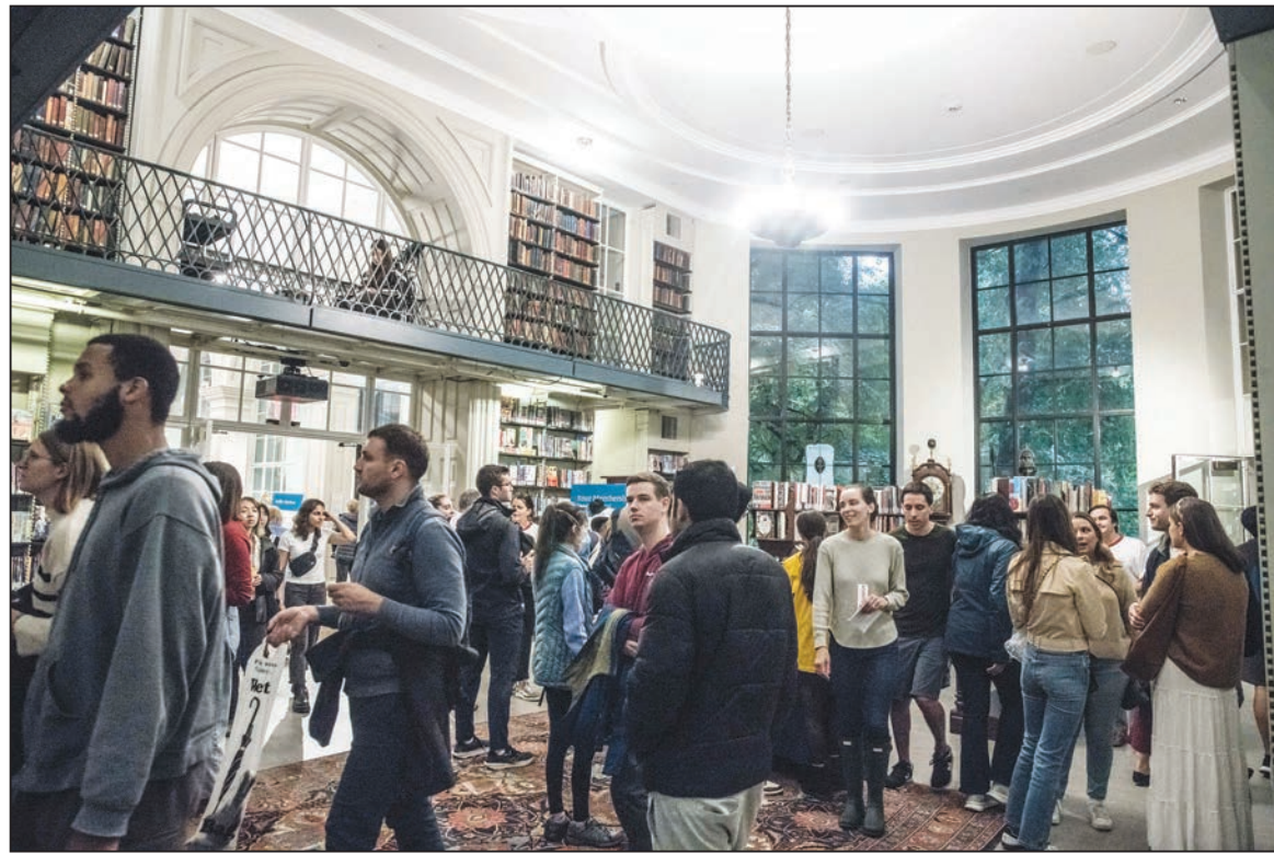
Visitors explore the many rooms of the Boston Athenaeum.