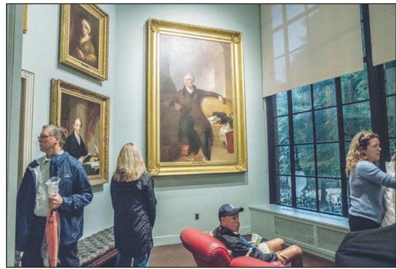
The Albert Gordon Reading Room is a cozy space to read any of the many books that reside in the Athenaeum.