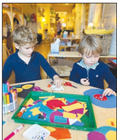
Making collages at Beacon Hill Nursery School.

The addition of a Middle School Experience (7th & 8th grades) and construction on MC's new $30+ million building continues to move ahead of schedule with opening next Summer. Some