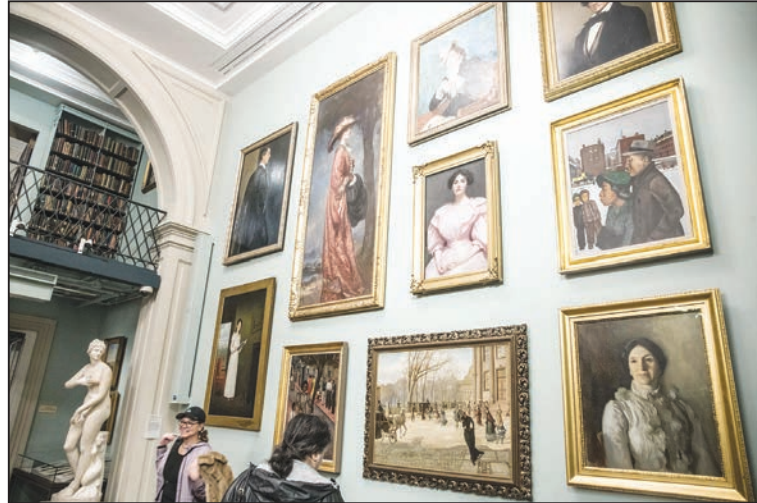
An array of paintings hang in the Nayard Henry Long Room.