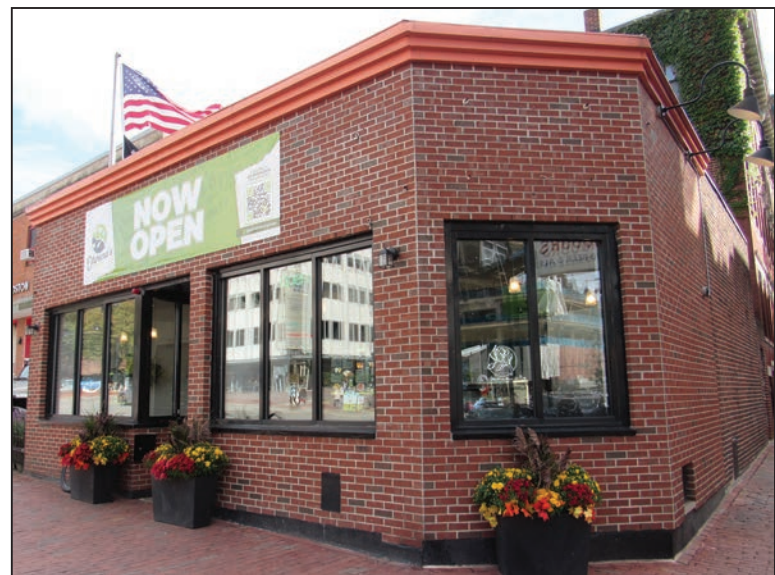
Oliveira's Express at 204 Cambridge St.