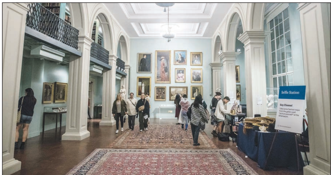
Many books holding much information and wisdom inhabit the Boston Athenaeum.