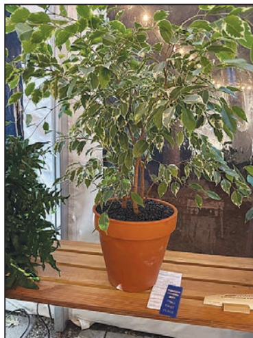
JOHN DAVID COREY Miguel Rosales' Blue Ribbon winner - Variegated Ficus Benjamina - Weeping Fig.

prizes in the Amateur Horticulture Competition, including Foliage Containers - Class 32 - Fern with a Kangaroo Foot Fern; Foliage Containers - Class 33 - Variegated with a Ficus Benjamina; Upcycle Class 49, with a variety of plants displayed in antique shoe shining box; and Par - Class 51 with a Ficus Altrissima Yellow Gem, respectively.