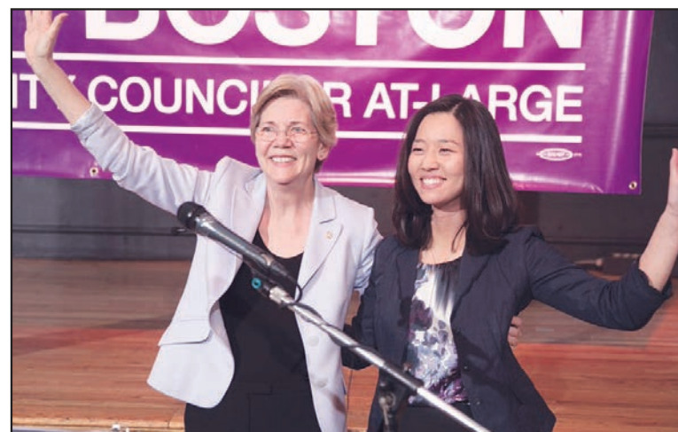
The mayoral race in Boston is shaping up. City Councilor and mayoral candidate Michelle Wu received an endorsement from Sen. Elizabeth Warren last week.

Warren said over the past seven years, Wu has carried her life experiences to City Hall as a tireless advocate for women, working families, and communities