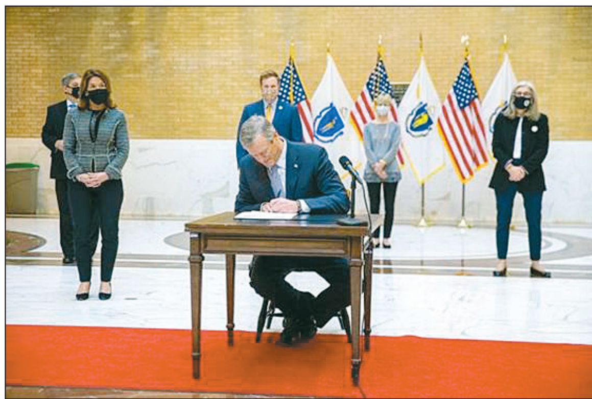
Gov. Charles Baker and Lt. Governor Karyn Polito joined legislators and public safety officials to participate in a ceremonial signing the Patient First Health Care and Police Reform bills.