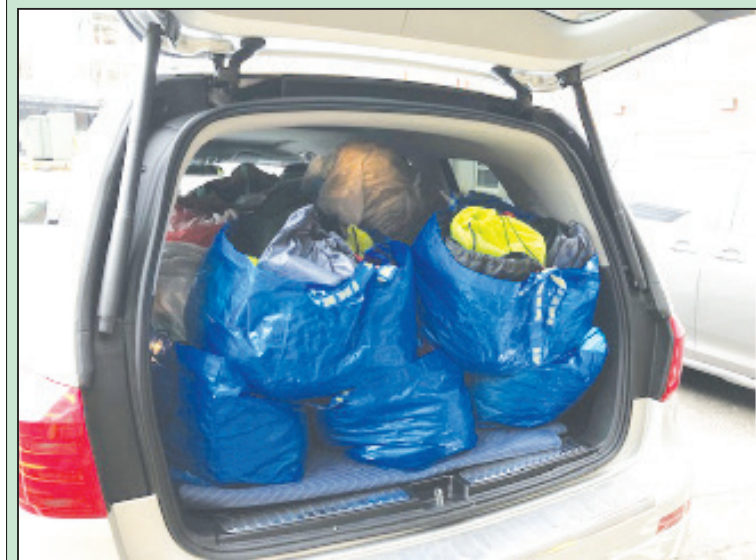
Some of the donated items for the BHCA Winter Clothing Drive.

For the latest news in Beacon Hill that you need to know, check www.beaconhilltimes.com