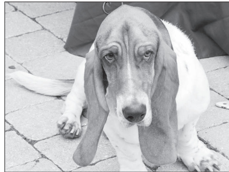
It is said that long, drooping ears on scent hounds are designed to scoop up any trace aroma and direct it to that skillful nose.

You can help prevent hearing loss in your dog with a prompt